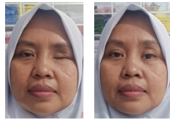
35-year-old, 2nd prosthetic eye