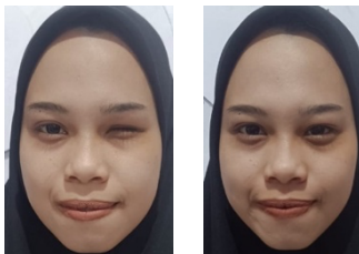
22-year-old, 1st prosthetic eye